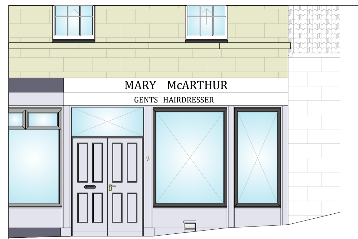
Existing Frontage South Elevation Scale 1:50