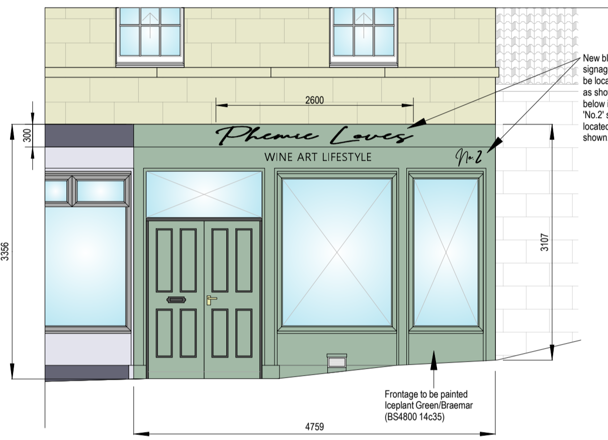
Proposed Frontage South Elevation Scale 1:50