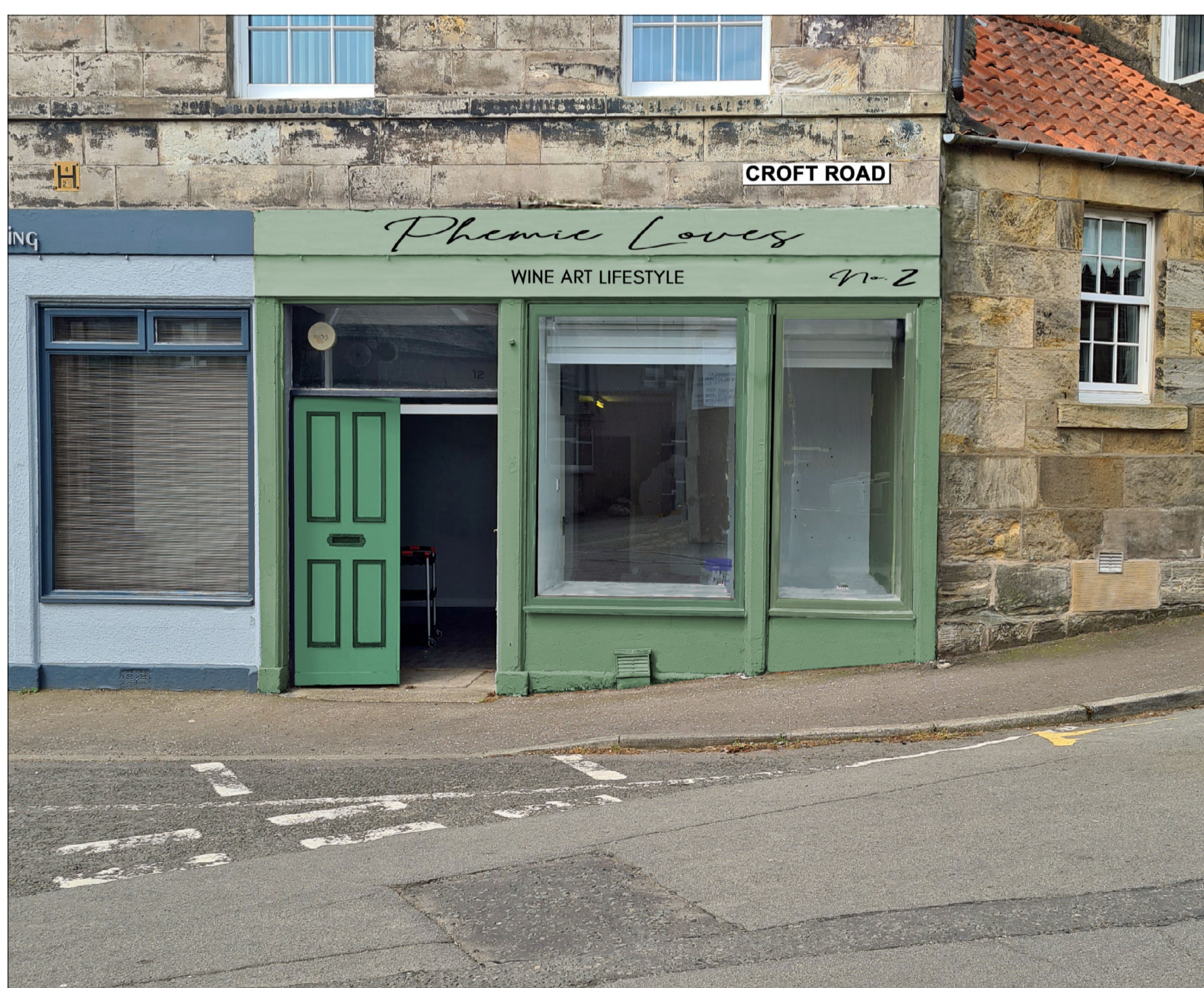
Photoshop Image Showing Proposed Frontage South Elevation NTS